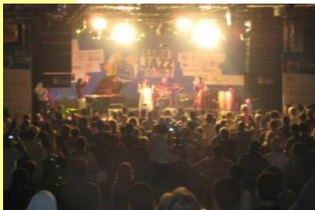
↑ Received an enthusiastic response at Cairo Jazz Festival. ←Photos and an interview of Kuriya are on the full front page of "Al-Ahram," the largest-circulation paper in Egypt.